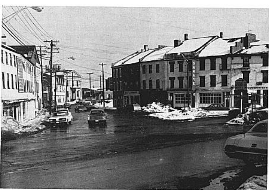
FIG. 1A. AND FIG. 1B. TWO VIEWS OF MARKET SQUARE, NEWBURYPORT. THE UPPER ONE SHOWS IT AS IT APPEARED IN MID-NINETEENTH CENTURY. AS IT APPEARS TODAY IS SHOWN IN THE LOWER VIEW