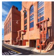
From left: MASS MoCA, North Adams, MA; Powerhouse Arts, Brooklyn, NY

Leading institutions around the world have successfully reimagined and revitalized urban areas using culture as a catalyst including MASS MoCA in North Adams, Massachusetts, and Powerhouse Arts in Brooklyn, New York. Other initiatives are in process across the country and around the world.