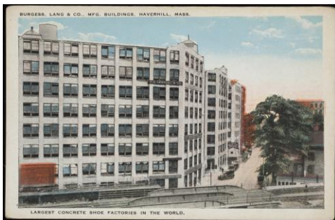
Postcard, c.1910-20 "Burgess, Lang & Co. Mfg. Buildings, Haverhill, Mass. Largest Concrete Shoe Factories in the World."

Haverhill is one of a group of midsize "Gateway Cities" designated for support by the State of Massachusetts because of their importance to local and regional economies and the opportunities they offer to expand on their historical importance, a deep and authentic architectural heritage, and potential for transformative economic and social redevelopment. Historically, Haverhill was known as the Queen Slipper City, the site of one of the world's largest manufacturing centers for shoes. With the loss of many of its manufacturing businesses and the subsequent decline of jobs,