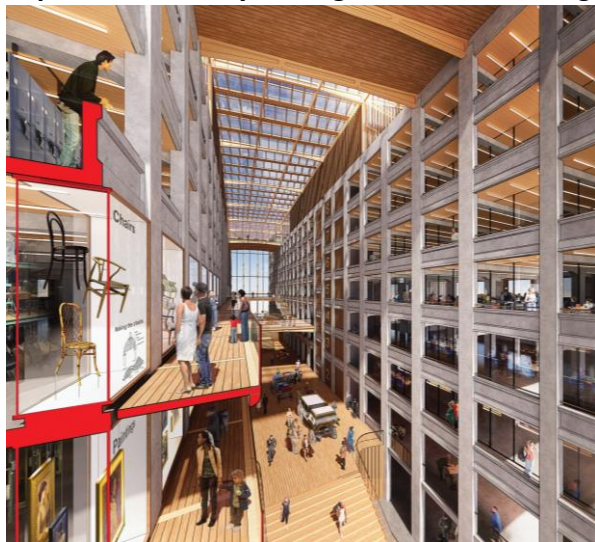
Design concept rendering, Brandon Haw Architecture

The Haverhill Center will dramatically expand and innovatively reimagine how people experience history through Historic New England's unmatched collections and archives ,