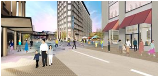
Design concept rendering, TenBerke Architects

Plans include reimagining over three acres of historic buildings and vacant property in the heart of downtown Haverhill at the doorstep of Commuter Rail and Amtrak. The new cultural destination and mixed-use district offers approximately 600,000 square feet of potential development, anchored by the new Historic New England Center for Preservation and Collections. The organization owns the world's largest collection of New England artifacts.