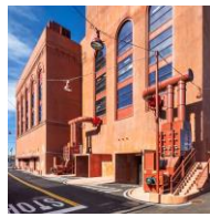
From left: MASS MoCA, North Adams, MA; Powerhouse Arts, Brooklyn, NY

Leading institutions around the world have successfully reimagined and revitalized urban areas using culture as a catalyst including MASS MoCA in North Adams, Massachusetts, and Powerhouse Arts in Brooklyn, New York. Other initiatives are in process across the country and around the world.