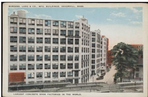
Postcard, c.1910-20 "Burgess, Lang & Co. Mfg. Buildings, Haverhill, Mass. Largest Concrete Shoe Factories in the World."

Haverhill is one of a group of midsize "Gateway Cities" designated for support by the State of Massachusetts because of their importance to local and regional economies and the opportunities they offer to expand on their historical importance, a deep and authentic architectural heritage, and potential for transformative economic and social redevelopment. Historically, Haverhill was known as the Queen Slipper City, the site of one of the world's largest manufacturing centers for shoes. With the loss of many of its manufacturing businesses and the subsequent decline of jobs,